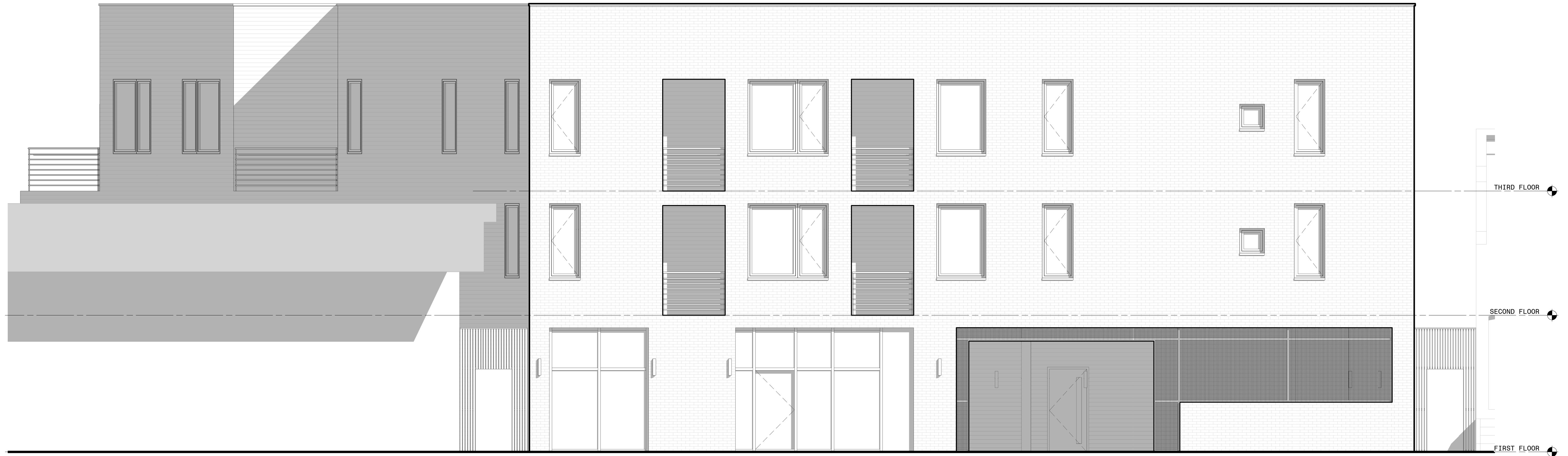
1 NORTH ELEVATION 1/4" = 1'-0"