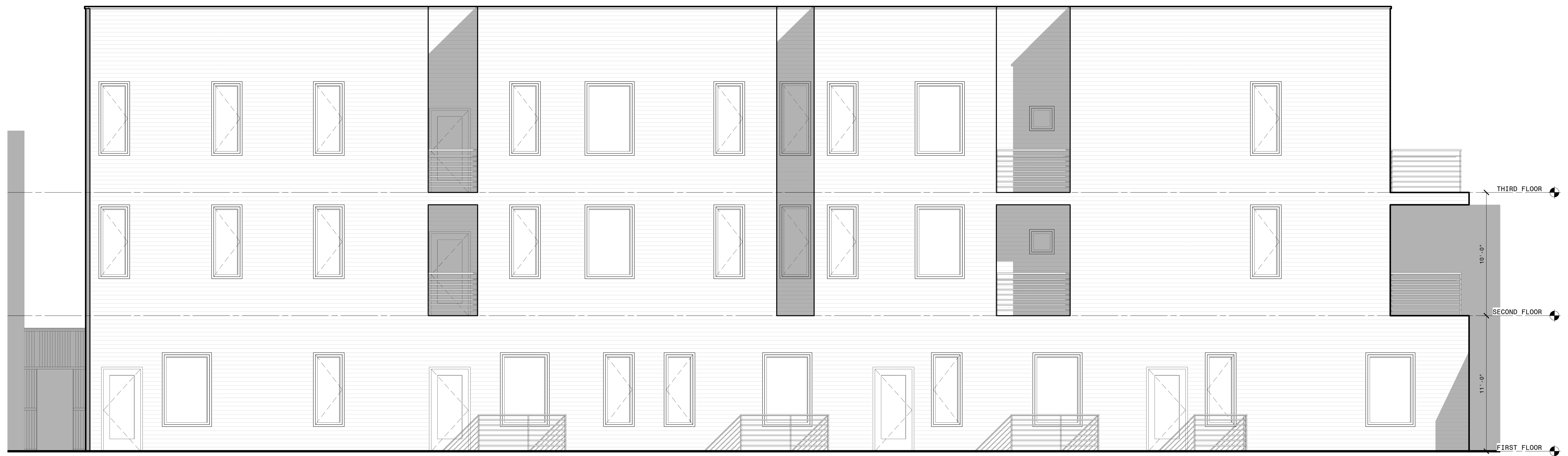
2 SOUTH ELEVATION 1/4" = 1'-0"